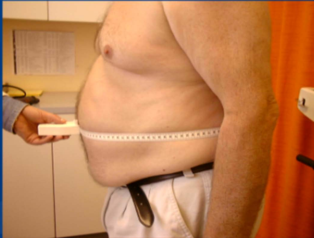
Vital Statistic: Waist Circumference